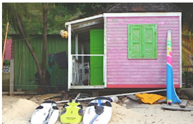
e- A beach house on Barbados, in the Caribbean