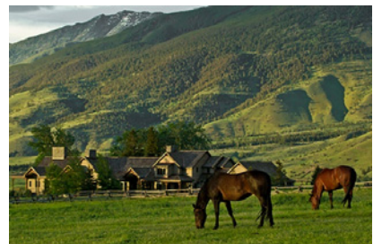
f- A ranch in Montana, USA