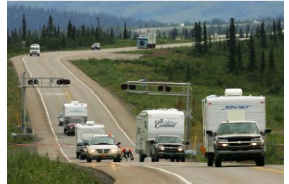
c- A recreational vehicle on American roads.