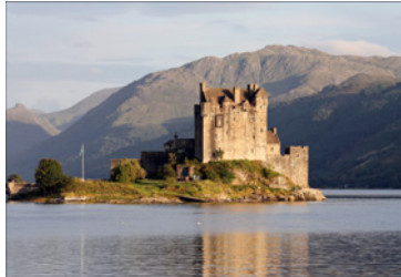
b- A castle in Scotland