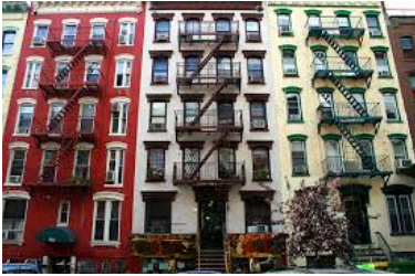
a- An apartment in New York City

1) You are going to spend the summer with two of your best friends. You have to decide where you are going to stay. Choose one of the following possibilities and try and convince your friends. Write the conversation.