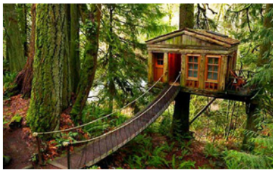
d- A treehouse in New Forest, United Kingdom